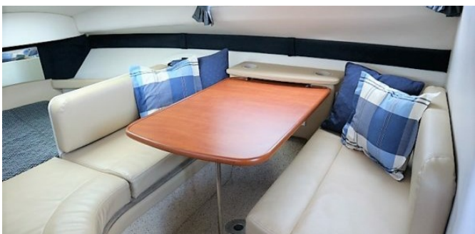
Dinette converts to berth