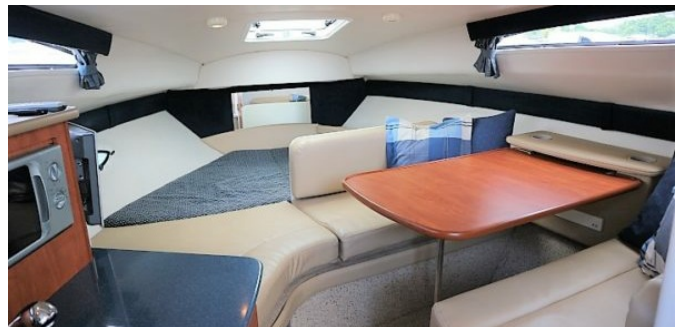
Forward berth arrangement