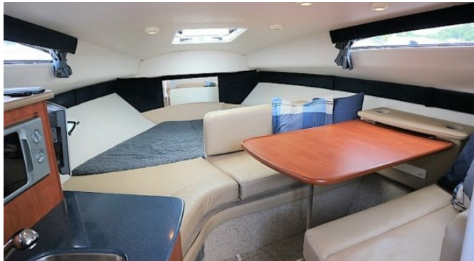
Forward berth arrangement