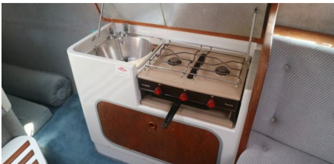
Galley to port