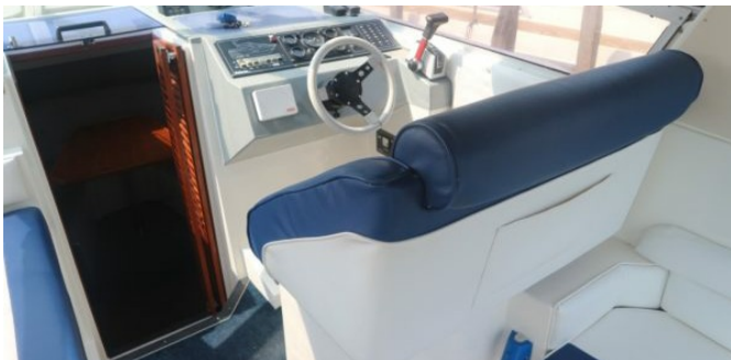
Helm to starboard