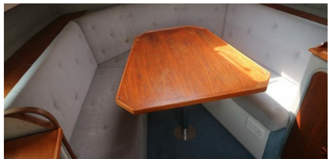
Saloon seating/second berth