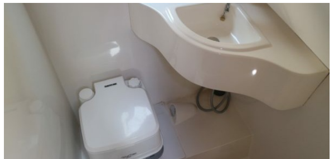
Heads to starboard