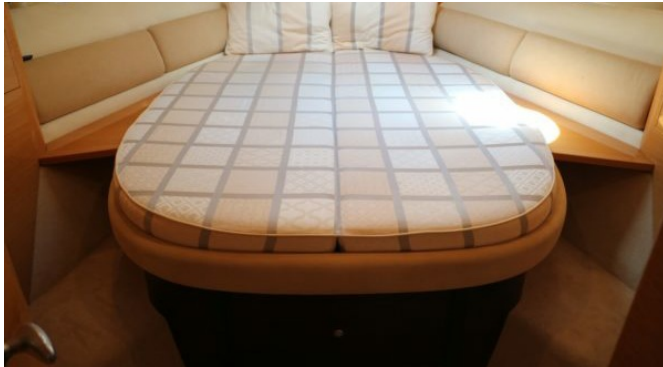
Forward cabin with island double