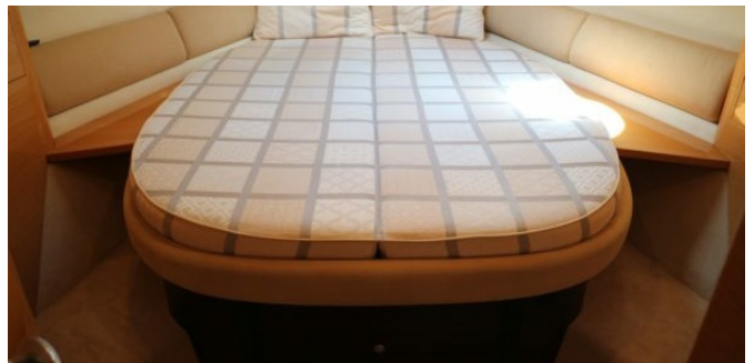
Forward cabin with island double