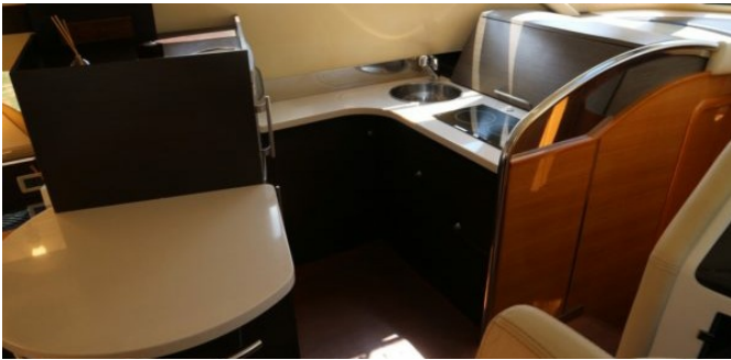
Galley to port