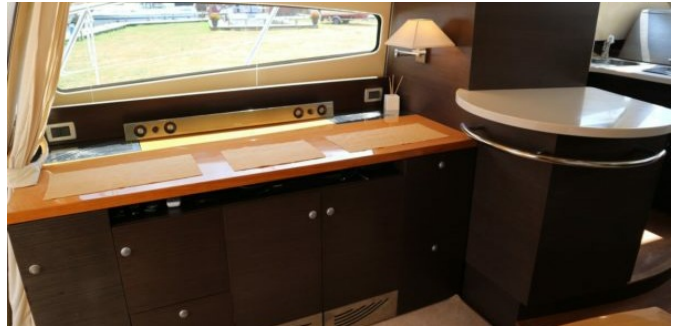
Saloon side board and lifting TV