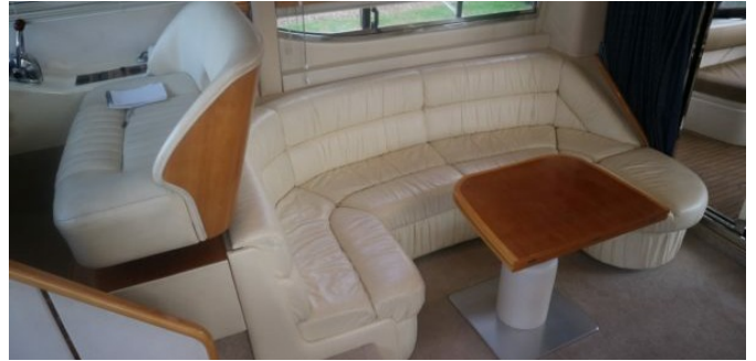
seating area on the princess