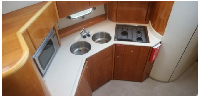
birds eye view of princess kitchenette