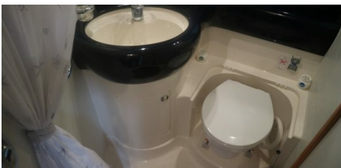
toilet and sink on board princess 420