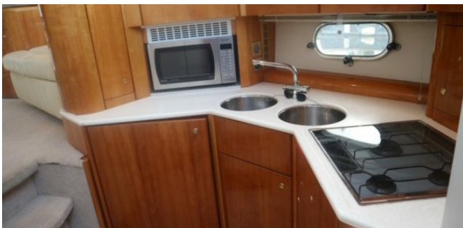
on board kitchenette (princess 420)