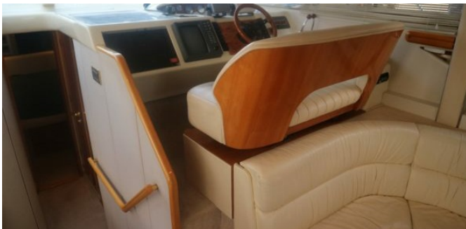
captains seat on the princess 420