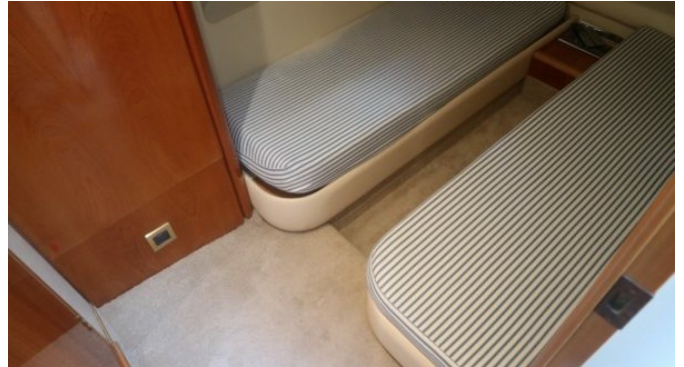
princess 420 twin bedroom