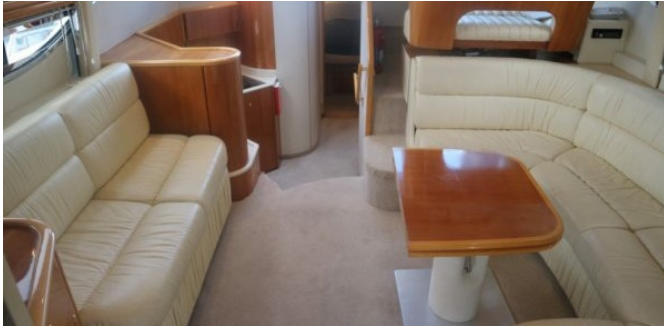
upper deck space on the princess 420