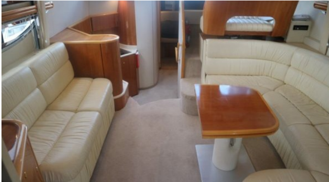
upper deck space on the princess 420